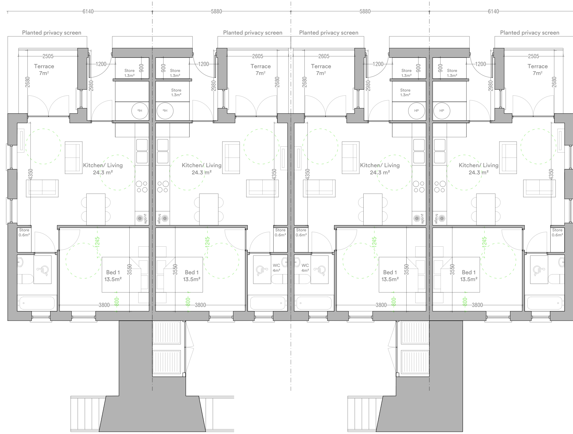
Duplex Block C Ground Floor